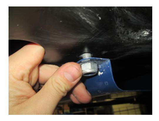
STEP 7: Tighten the (2) rearward M10 x 60mm bolts and torque to 31 ft lbs.