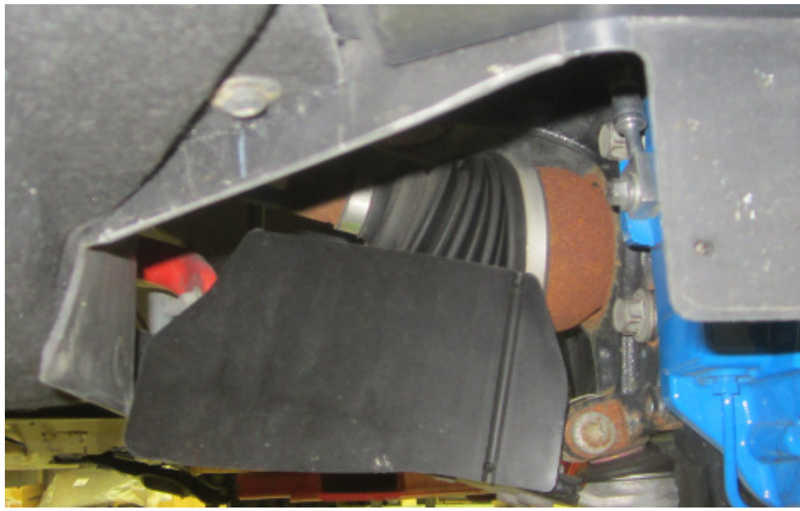
Trim inner wheel wells to allow direct air flow to deflectors. (LH side shown)

NO PART OF THIS DOCUMENT MAY BE REPRODUCED WITHOUT PRIOR AGREEMENT AND WRITTEN PERMISSION OF FORD PERFORMANCE PARTS