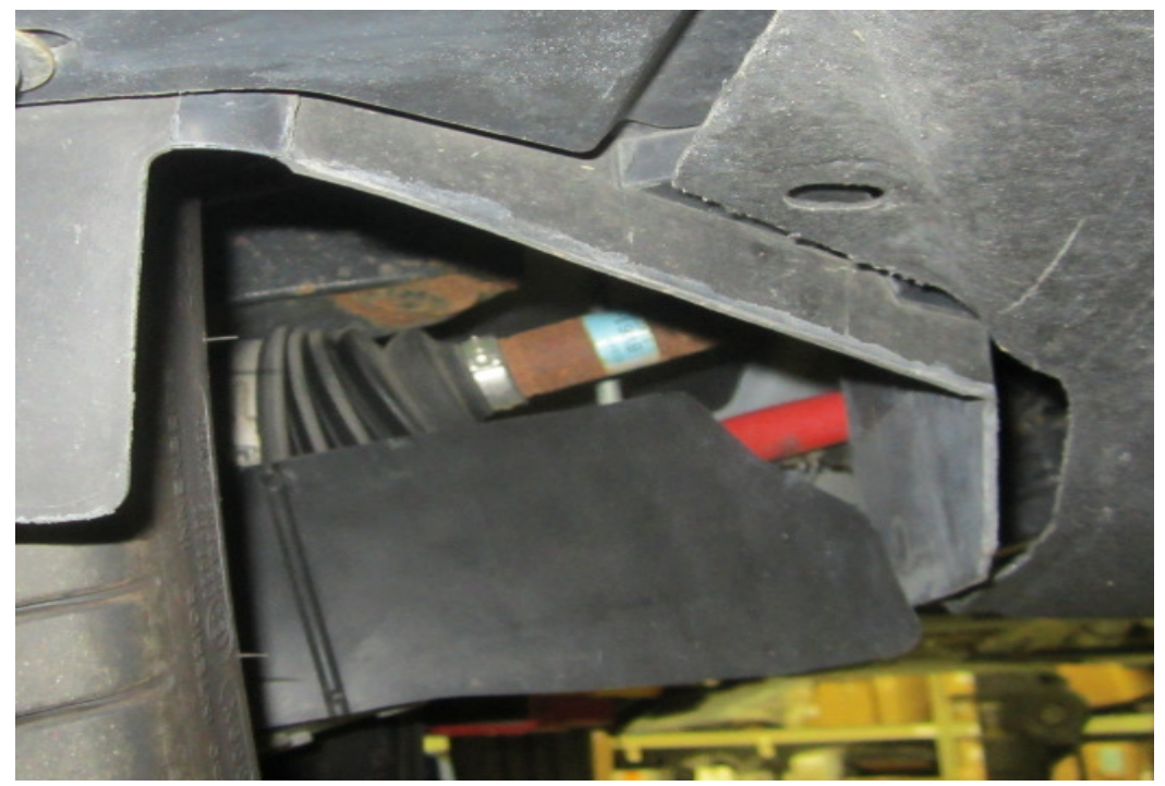
Trim inner wheel wells to allow direct air flow to deflectors. (RH side show)

Factory Ford shop manuals are available from Helm Publications, 1-800-782-4356